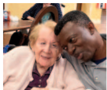
Bond Between A Staff and Resident